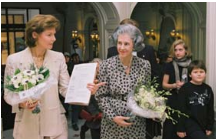
Royal reception: HM Queen Fabiola and HRH Princess Margaretha at the D-I-T-T press launch

Television, radio, newspaper and magazine journalists flocked to the launch of D-I-T-T's revolutionary multi-lingual CD-rom, The Mystery of the Lost Letters (MOLL) , last November.