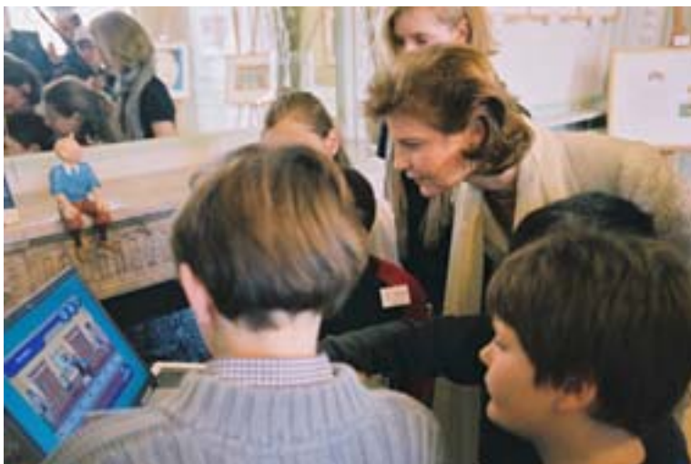
Below – HRH Princess Margaretha previews Tintin’s latest quest with the help of youngsters from the focus group

Youngsters from D-I-T-T’s focus group, whose input helps shape The Mystery of the Lost Letters , were called on to talk about their experiences with dyslexia.