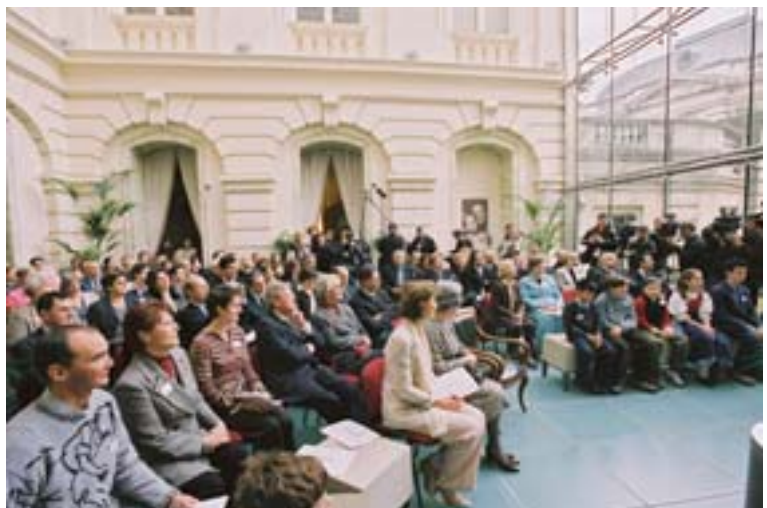
CD-rom unveiled: HM Queen Fabiola and HRH Princess Margaretha invited D-I-T-T and journalists to the Palais de Bellevue

'Dyslexic learners face one failure after another in schools where success is measured purely on the basis of performance in basic skills. Superior skills often go unrecognised and are neglected.